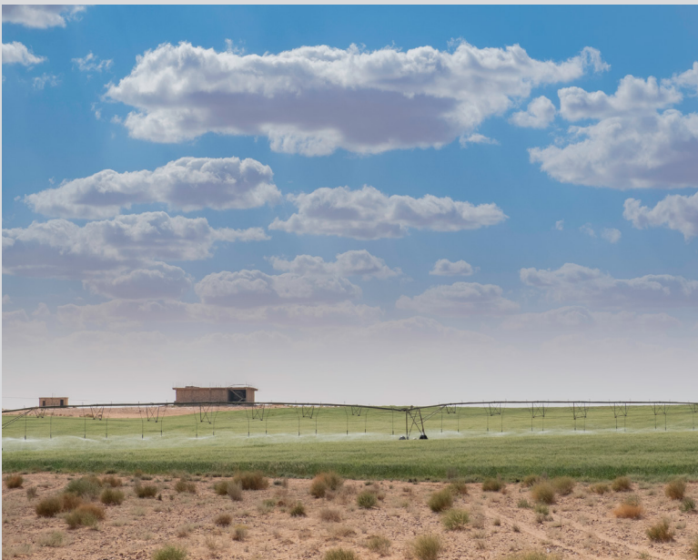
Watering the Sahara desert, Algeria

In Algeria and Egypt, there is an increasing trend of farming around oases deep in the Sahara Desert by digging wells for irrigation from non-renewable groundwater resources. In Algeria, 40 percent of the potatoes on the market is cultivated around El Oued, a Sahara Desert town, using over-crop sprinkler pivot irrigation, which help cool crops while leading to substantial water evaporation ( https://www.potatopro.com/algeria/potato-statistics ) and https://www.ars.usda.gov/ARSEUserFiles/21563/Irrigation%20Technologies%20Comparisons.pdf ). In Egypt, irrigated agricultural production has increased around the Oases of Bahariya and Farafra where the aim is to reclaim 1.5 million feddans from the desert through irrigation by pumping groundwater resources from the Nubian Sandstone aquifer ( http://www.takepart.com/feature/2016/01/08/desert-farming-egypt ). In both cases, the water is being pumped from fossil aquifers, which are not replenished meaning that agricultural production will be possible only until the aquifers run dry. This will greatly impact life in neighboring Oases and towns, which depend on those aquifers for their water needs.