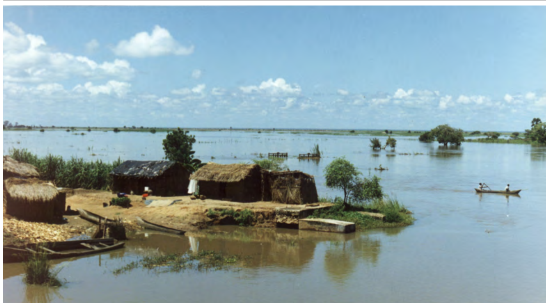
Flooding in the Pungwe River, Mozambique.