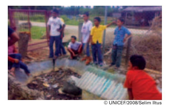
During a tour, children in Indonesia point to undesirable environmental features in their community.

b. Community tours. Taking tours with children is one of the best ways to understand key features of a community. During these tours, children point out factors they think are important, and the facilitator asks questions to better understand the issues. Taking photos and videos during the tours helps with review and communication with other groups. Children can be creative photographers and filmmakers.