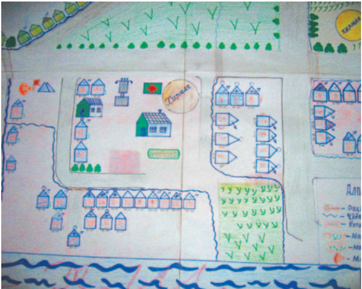
The community map generated by children is displayed in their school.

During a field visit in Georgia, the author observed children in an elementary school. The students had ensured the inclusion of all children by generating a map of their community and posting it on a wall in their school. The map shows every house in the community and the number of school-aged children living in each house. Households where children are not attending school or have had long periods of absences are clearly marked, pushing the school and community to take action. Additionally, homes of families who live in poverty or with children with special needs are identified. The student committee in charge of the project regularly updates the map. The committee indicated that the children are planning to use the same strategy to identify various environmental resources in their community.