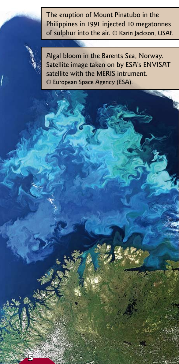
Algal bloom in the Barents Sea, Norway. Satellite image taken on by ESA's ENVISAT satellite with the MERIS instrument.