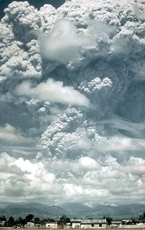
The eruption of Mount Pinatubo in the Philippines in 1991 injected 10 megatonnes of sulphur into the air.