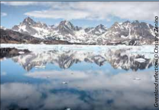
Greenland reflections