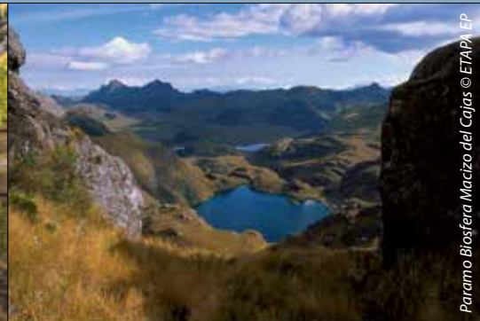
Paramo Biosfera Macizo del Cajas