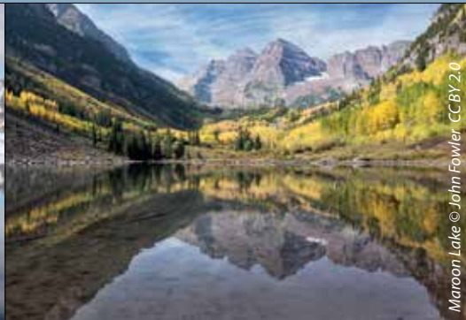
Maroon Lake