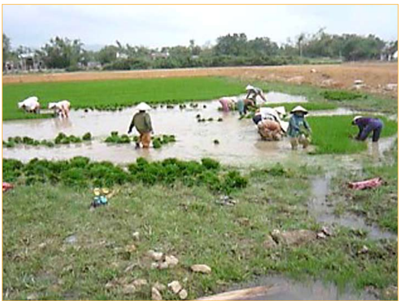
Local farmers in Vietnam adapting to the saltwater intrusion by applying different cropping techniques (paddy fields) that will sustain the saltwater that has moved inland.