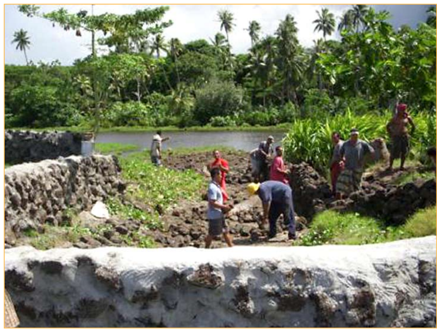
Reinforced protection for flood management in the Cam Tam Commune, Than hoa to reduce the impacts of flashfloods.