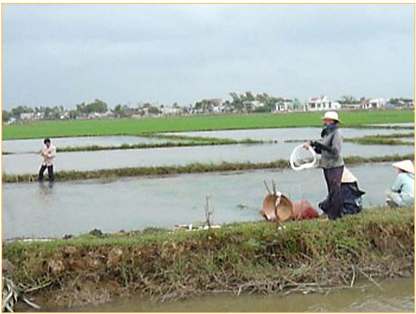
Growing drought and salinity tolerant rice varieties in the Bac lieu Province, Mekong delta, Vietnam.

The CBA programme is a collaboration led by United Nations Development Programme (UNDP), with financing from the Global Environmental Facility (GEF). The GEF Small Grants Programme (SGP) is the delivery mechanism.