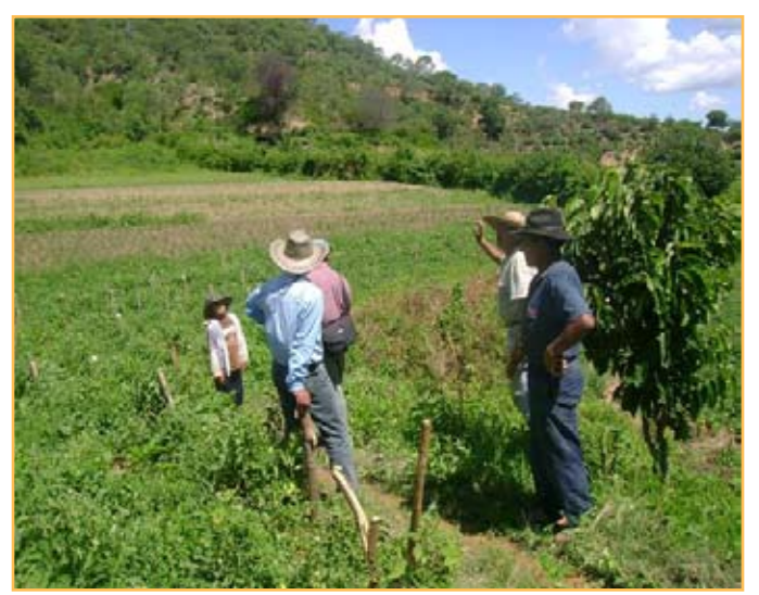
Field diagnosis in Saipina Municipality for project "Adapting agroforestry in Saipina, Bolivia".

Saipina is located in Bolivia's "warm valleys", an area of transition between the western high plains and the eastern lowlands. The project area has one rainy season, which is also the main agricultural production season, and a dry season when cultivation is dependent on irrigation from a nearby river. The area's poor families rely on their crops for food and income, making them highly dependent on their environment, especially the local river. When rainfall levels are low, the river runs dry for several months. While there is some irrigation, the methods used are rudimentary and inefficient. Local forests are also threatened. Their overuse for animal forage and fuelwood exacerbates deforestation and is leading to a progressive loss of woodland vegetation and productive soils. The combined problems of water scarcity, resource degradation, and cyclical change in rainfall patterns (linked to El Niño and La Niña) jeopardize food security. To diversify livelihoods and increase incomes, the two project communities have recently increased cultivation of cherimoya, a native fruit crop.