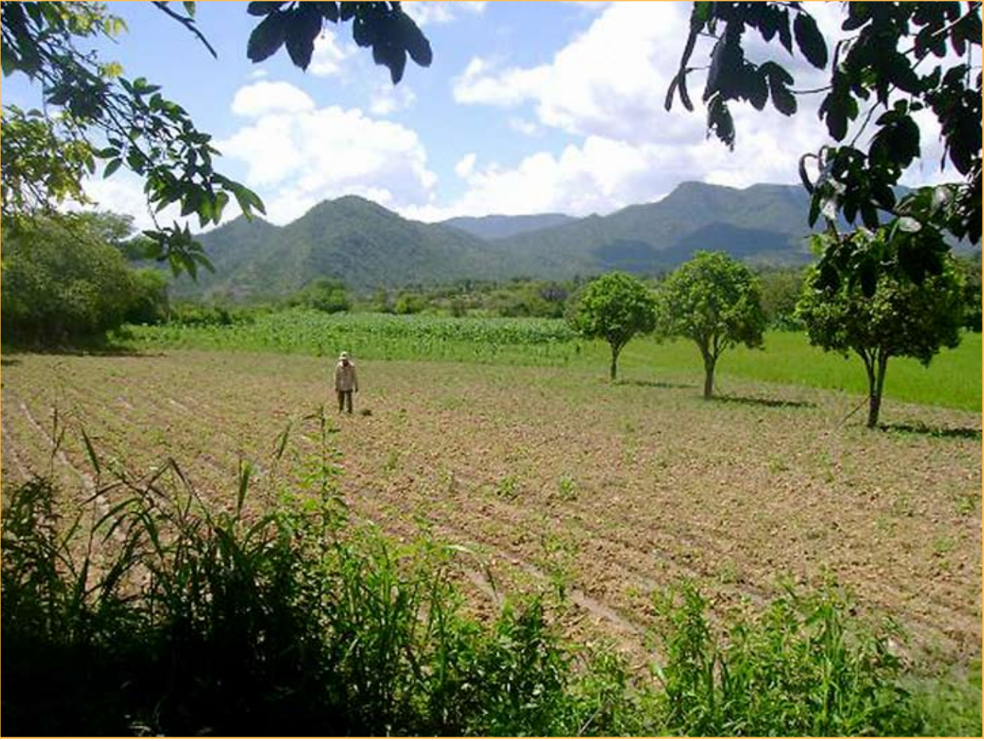
A farmer inspecting young cherimoya fields in Moro Moro, Bolivia.

The CBA programme is a collaboration led by United Nations Development Programme (UNDP), with financing from the Global Environmental Facility (GEF). The GEF Small Grants Programme (SGP) is the delivery mechanism. The UN Volunteers partners with UNDP and GEF-SGP to enhance community mobilization, recognize volunteers' contribution, and ensure inclusive participation around the project. A national UNV volunteer is dedicated to the CBA programme in Bolivia in this respect.