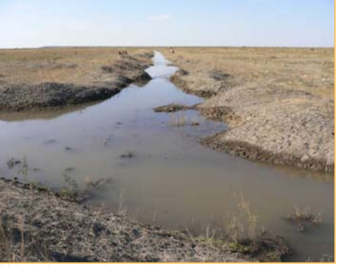
Melted winter snow intrusion into the grazing fields in Kazakhstan.

Like much of Kazakhstan, the project area faces increasing aridity due to climate change and man-made environmental pressures. The hardy sauxal tree plays an important role in fixing soil and maintaining the productivity of pastures. The challenge that many sauxal forests were cut down in the 1990s, disturbing the pastoral ecosystem and causing land degradation. Other pressures on pastoral lands include disruption of traditional pasture management practices, growth in private livestock herds, and the deterioration of a Soviet-era irrigation dyke. The decline in pastoral resources has reduced villagers' income from livestockraising and forced many in this poor region into maladaptive coping strategies, such as poaching and illegal fishing. Climate change is expected to exacerbate existing pressures and make it increasingly difficult for residents to make a living from their livestock. Increased temperatures, especially in winter, and more evaporation in summer have already been observed in the project area and are expected to become more severe. These changes will increase overall aridity, threatening the productivity of pastoral lands by decreasing the availability of forage and water for irrigation.