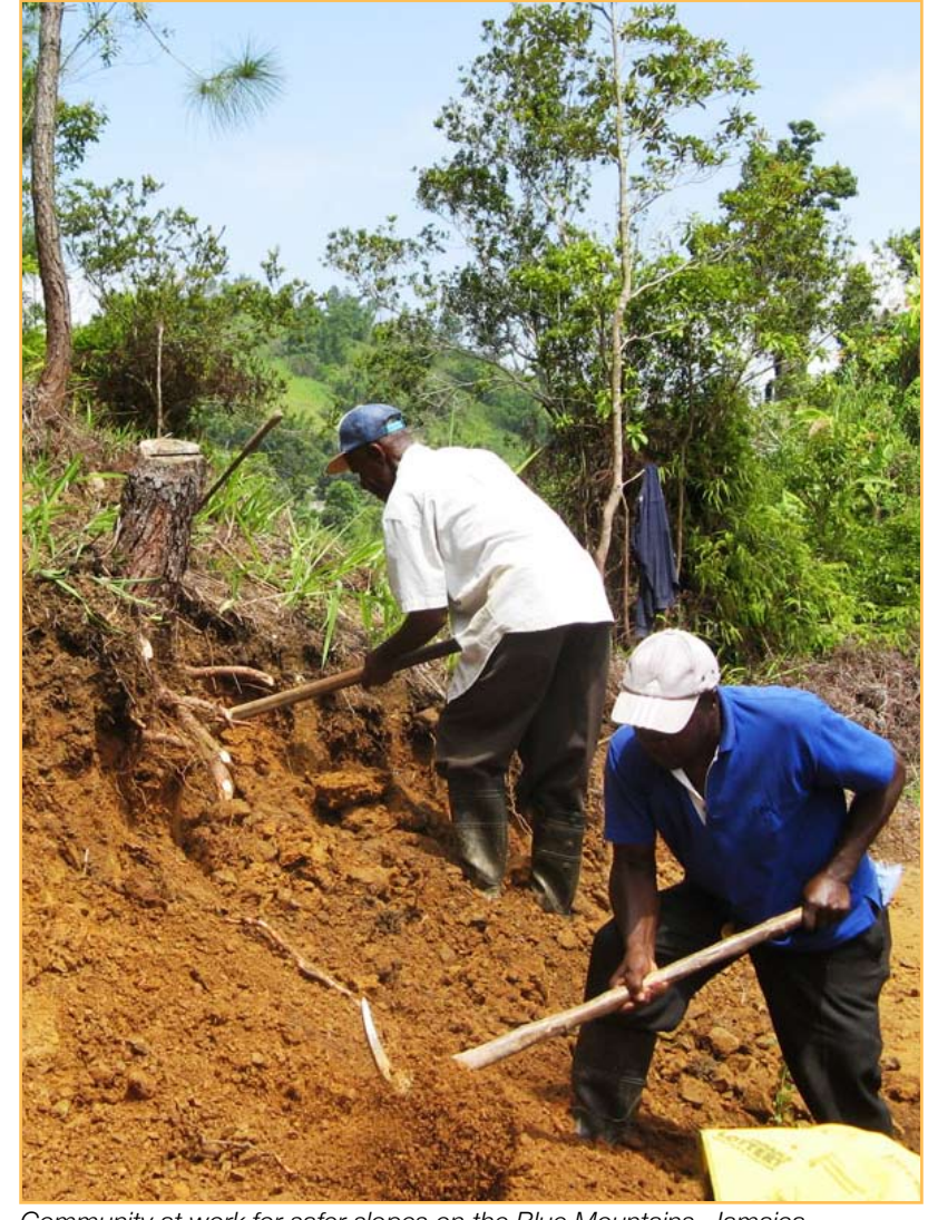
Community at work for safer slopes on the Blue Mountains, Jamaica.

The CBA programme is a collaboration led by United Nations Development Programme (UNDP), with financing from the Global Environmental Facility (GEF). The GEF Small Grants Programme (SGP) is the delivery mechanism. The UN Volunteers partners with UNDP and GEF-SGP to enhance community mobilization, recognize volunteers' contribution, and ensure inclusive participation around the project. A national UNV volunteer is dedicated to the CBA programme in Jamaica in this respect.