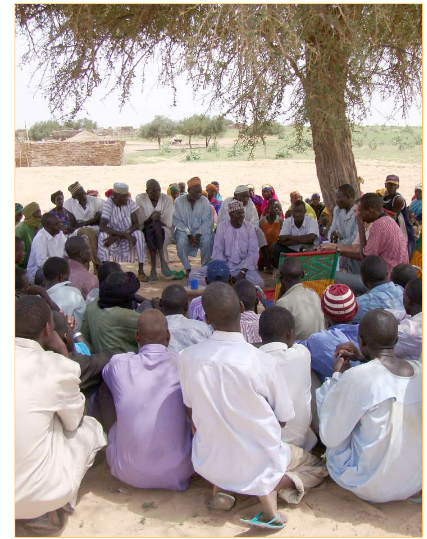
A community meeting at the Maikoulake Village, Niger.

The CBA programme is a collaboration led by United Nations Development Programme (UNDP), with financing from the Global Environmental Facility (GEF). The GEF Small Grants Programme (SGP) is the delivery mechanism. The UN Volunteers partners with UNDP and GEF-SGP to enhance community mobilization, recognize volunteers' contribution, and ensure inclusive participation around the project. A national UNV volunteer is dedicated to the CBA programme in Niger in this respect. In addition, The Governement of Japan co-finances this project.