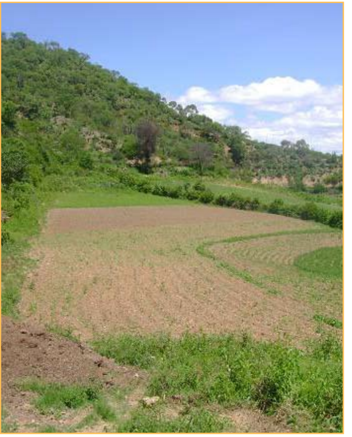
Improving cherimoya production through soil conservation techniques such as terracing and contour planting.

crease the risks of both flooding and water shortages, as melting glaciers are less able to store water for steady release throughout the year. Increasing evaporation driven by rising temperatures, in combination with higher rainfall variability, is likely to significantly decrease water availability and bring drought. With these additional climate change pressures, farmers may be forced to cultivate new lands, creating a climate-driven cycle of land clearing and degradation that contributes to deforestation.