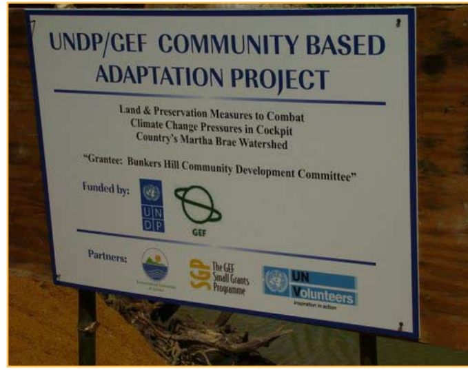
Launch of CBA project in Bunker's Hill, Jamaica.

The CBA project is working through the local Bunkers Hill Community Development Council to stabilize and reinforce riverbank slopes to protect against the loss of agricultural lands. The project aims to fortify community resources, such as croplands and bridges, and make them increasingly resilient to flooding and erosion. Techniques include building culverts to divert floodwaters away from bridges and reinforcing erosion-prone areas by constructing "natural" stone barriers and planting indigenous species.