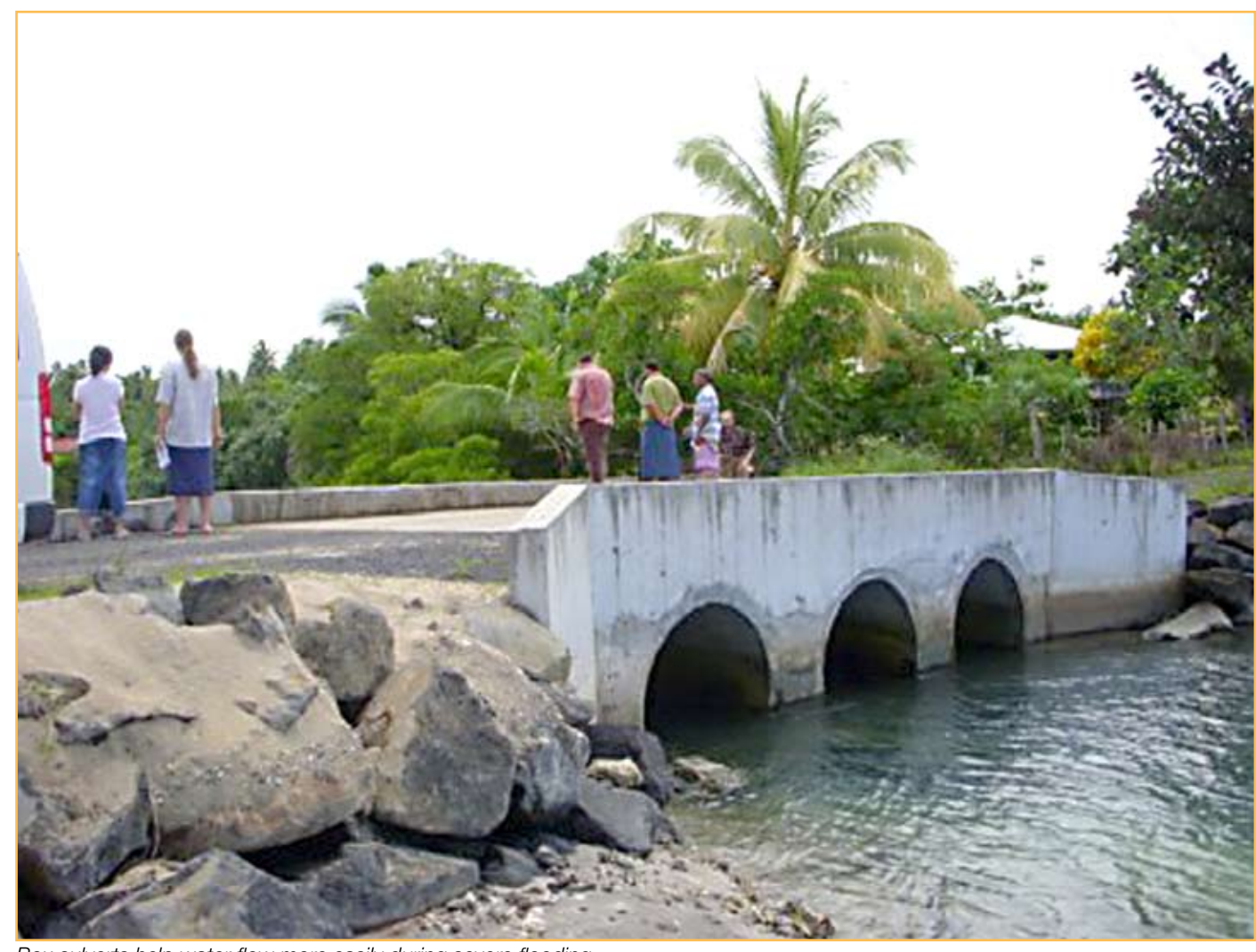
Box culverts help water flow more easily during severe flooding.