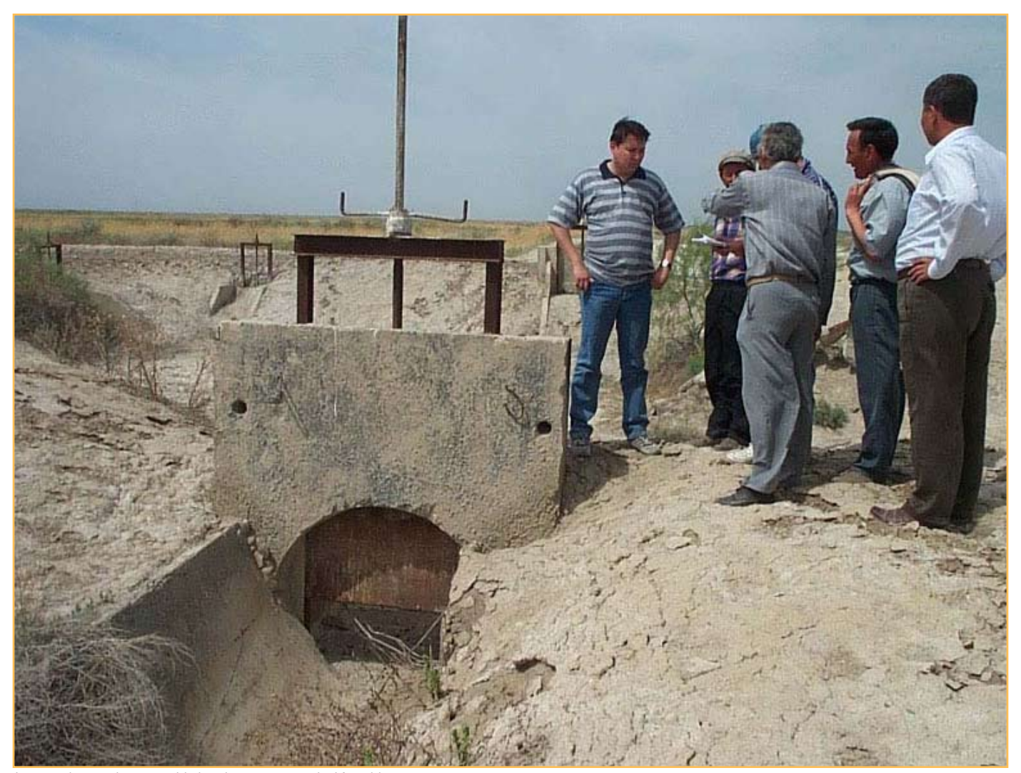
Inspecting a damaged irrigation systems in Kazakhstan

The CBA programme is a collaboration led by United Nations Development Programme (UNDP), with financing from the Global Environmental Facility (GEF). The GEF Small Grants Programme (SGP) is the delivery mechanism. The Government of Switzerland co-finances additional activities in this project, as well as the other CBA projects in Kazakhstan and Central Asia.