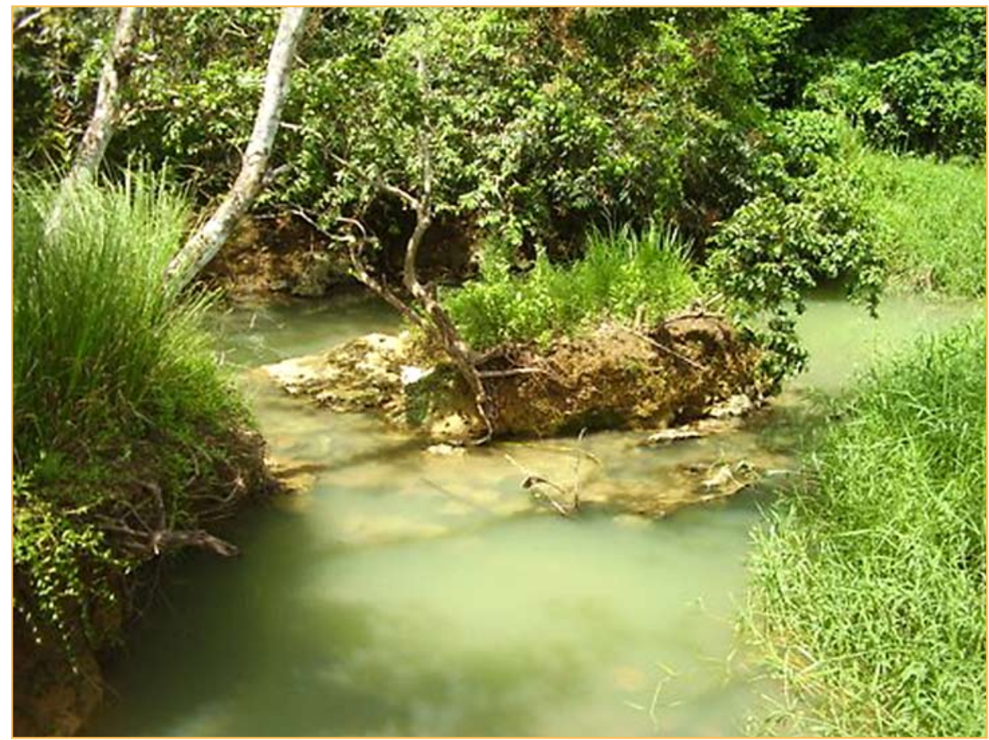
Exposed roots and destabilized tree resources along a river course in the Bunkers hill community area, Jamaica.

The CBA programme is a collaboration led by United Nations Development Programme (UNDP), with financing from the Global Environmental Facility (GEF). The GEF Small Grants Programme (SGP) is the delivery mechanism. The UN Volunteers partners with UNDP and GEF-SGP to enhance community mobilization, recognize volunteers' contribution, and ensure inclusive participation around the project. A national UNV volunteer is dedicated to the CBA programme in Jamaica in this respect.