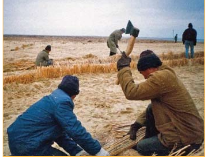
Creating sand protection belt around a village in Kazakhstan.

Long-term climate change projections for Kazakhstan forecast rising temperatures and declining average rainfall, which will lead to increased aridity in the already dry country. Drought is the main climate risk facing the village of Lepsy, where the harsh climate makes agriculture impossible. Decreasing soil moisture levels are already reducing fodder growth, lowering grazing capacity for local livestock, and contributing to pasture degradation. As a pastoral community, they rely on products generated from livestock, such as milk, meat and wool, as a source of income. The productivity of livestock is highly dependent upon the quality of forage available, as cattle, goats, horses and sheep require sufficient pasture. Undernourished animals sell at low prices and produce little milk. Aware