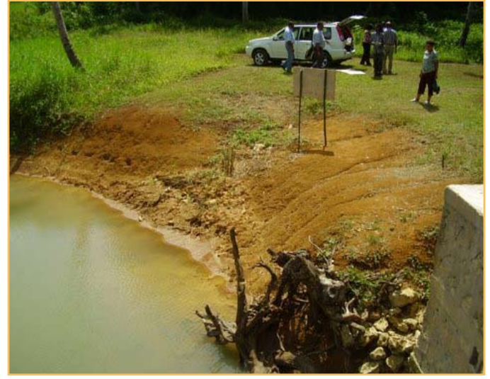
An eroded riverbank in the Bunker's Hill community, Jamaica.

Climate change projections for Jamaica include an increased intensity of extreme storms and rainfall, as well as worsening levels of drought. In the Cockpit Country, increases in rainfall intensity will heighten the risk of flooding, especially during the rainy seasons. Existing flash flood patterns already pose a significant threat as river embankments erode and the stability of bridges is compromised. Exacerbation of flash flooding risks due to climate change would further threaten the viability of agriculture in the region by destroying crops, eroding lands, and spreading chemical contaminants.