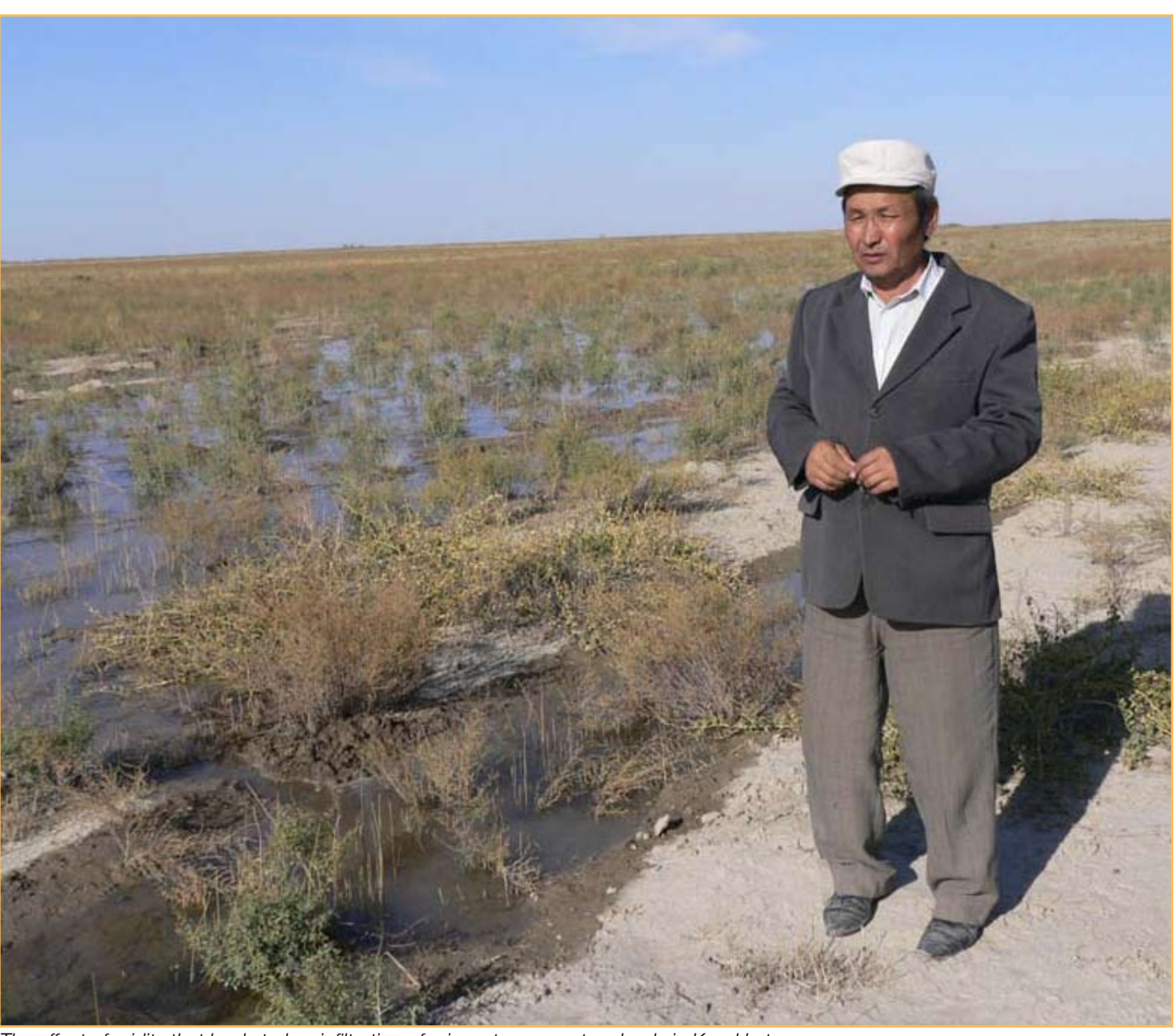
The effect of aridity that leads to low infiltration of rain water on pasture lands in Kazakhstan.

this project is used for the expansion of the fertilized inundable lands through purchase and application of additional 6,000 kilograms of nitrate on 20 hectares under the snow. The environmental issue addressed is the conservation and rehabilitation of ecosystems and pasture biodiversity, which are weakened by overgrazing especially during early spring season. In addition, this activity addresses a social and economic issue of improving the fodder stock for a cost-effective cattle breeding process. Increase in fodder stock will enhance the adaptative capacity of the community to climate aridity by raising cattle productivity and decreasing the level of cattle mortality. Thus, the livelihoods of the community and infrastructure will be improved.