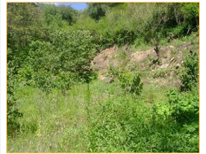
A degraded watershed area from deforestation and climate change driven factors such as floods and erosion, in the warm valleys of Moro Moro, Bolivia.

The CBA project also helps the community improve its knowledge of climate change and learn adaptive practices to help it cope with its impacts. Municipal residents, including children and youth, learn about climate change risks through two-day workshops. Participatory meetings are held to document historical and current climate variability and how it affects agricultural production. These records serve as baseline measurements, against which future environmental changes can be evaluated.