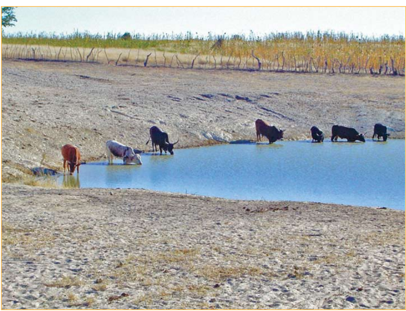
Livestock water ponds constructed for collecting surface run-off and stored for livestock water source during the dry season.

The CBA programme is a collaboration led by United Nations Development Programme (UNDP), with financing from the Global Environmental Facility (GEF). The GEF Small Grants Programme (SGP) is the delivery mechanism. The UN Volunteers partners with UNDP and GEF-SGP to enhance community mobilization, recognize volunteers' contribution, and ensure inclusive participation around the project. A national UNV volunteer is dedicated to the CBA programme in Namibia in this respect. In addition, The Government of Japan co-finances this project.