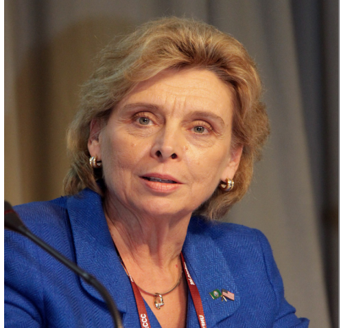
Governor Christine Gregoire, Washington state, highlighted various state-level policies in Washington state, including: statutory targets; tax incentives; and clean energy standards.

Premier Greg Selinger, Manitoba, noted the importance of hydropower in achieving emission reduction goals in Manitoba, and emphasized the involvement of first nations as "equity stakeholders" in dam projects. Noting energy efficiency plans that incorporate low-income programming that engages inner city people, he pointed to resulting social justice and energy benefits. He also highlighted a coal tax that is due to come into place in 2011 and recent increases in Boreal protected areas.