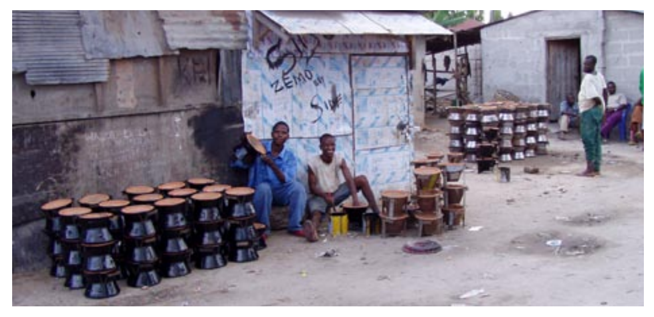
Selling improved wood stoves