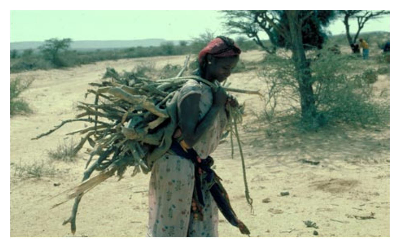
Woman collecting wood in arid zone

PRSPs can be strengthened by Ministers to offer more appropriate institutional arrangements, leading to better inter-sectoral coordination and greater impacts.