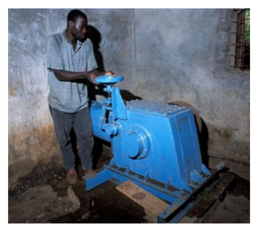
Hydro power scheme, Mbuiru Village, Kenya, Implemented by Intermediate Technology Development Group/ Ministry of Energy

3 The regional scale up strategy will be developed and coordinated within existing regional and global initiatives, notably the Forum of Energy Ministers of Africa (FEMA), the Millennium Summit 14-16 September 2005 and the Commission on Sustainable Development in 2006 and 2007. It is also understood that implementation and delivery is primarily at the national level, supported by a regional framework.