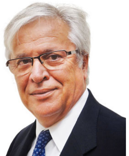
Dr. Joan Clos, the Executive Director of UN-Habitat authored the present article. An expanded version appeared in the "Climate Action" 2013 edition.