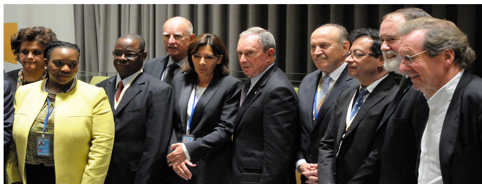
Group shot from the Cities Action Announcements session.

Parties launched the Resilient Cities Acceleration Initiative campaign to double the number of cities and partners in support of city resilience building; to assist five hundred local governments to develop resilience action plans; and to catalyze US$2 billion of