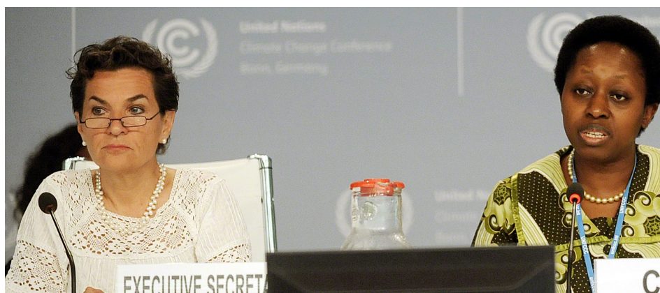
Flanked by the Executive Secretary of UNFCCC, Christina Figueres, the UN-Habitat DED Dr. Aisa Kirabo Kacyira (right) chairs the City Forum.

The Forum reflected the growing realization that cities and other subnational entities play an important role in addressing the climate challenge, but are not yet fully integrated into national and international frameworks. Through the Forum, member states were able to discuss and evaluate the possibilities and modalities of how