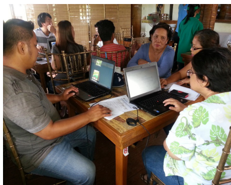
Members of the Guiuan Recovery and Sustainable Development Group reviewing climate change vulnerability assessment and hazard maps updated after Typhoon Haiyan.

In order to mainstream climate change and disaster risk reduction in comprehensive land use plans, as advised by the Housing and Land Use Regulatory Board of the Philippines, cities in the Philippines are preparing Climate and Disaster Risk Assessments, following guidelines prepared with the support of the Cities and Climate Change Initiative of UN-Habitat.