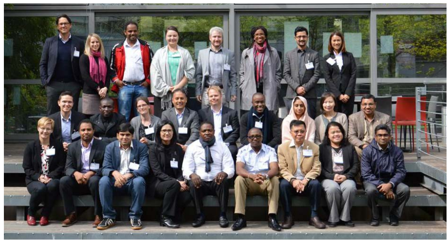
The first AFFP fellows at Frankfurt School for the Kick-off in April 2017

enhance sharing of knowledge and best practices and to enable the development of relevant climate solutions. At the end of each programme, the AFFP-fellows will be equipped with the necessary tools to allow them to mobilise finance for resilient development in their respective countries.