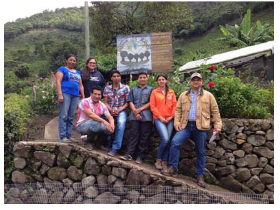
Ecotourism as an EbA measure: The MEbA team visiting the clients

MEbA focused on supporting climate-smart adaptation approaches or (M)EbA, fostering and piloting the use of new and amended microfinance instruments to that end. By the end of last year, partner MFIs financed 7,125 MEbA loans in total with an average loan of USD 1,300, resulting in an estimated leverage of more than USD 9M. Out of the 40 (M)EbA measures identified during the project, partner MFIs financed almost half of them (organic fertilisers, soil conservation, crop