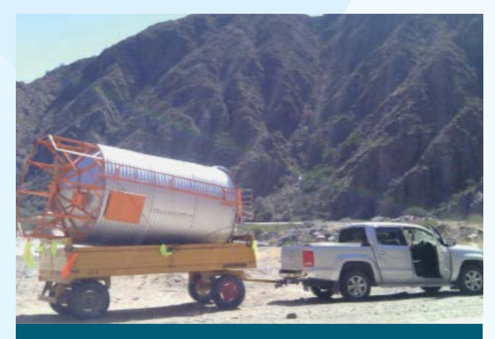
4- Grain purchased in groups is brought by truck from remote areas.