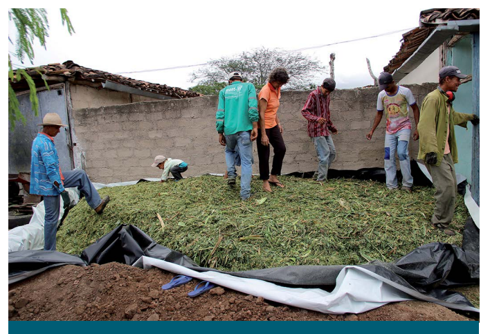
5- Storing forage (1 to 3 years).

4- Rainfed hay and irrigated forage + balanced diet.