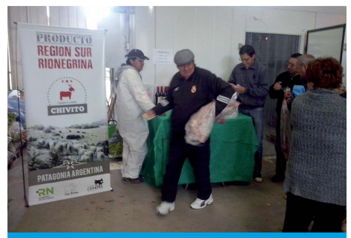
6- The general public buying goats in Bariloche's Mercado Municipal market.