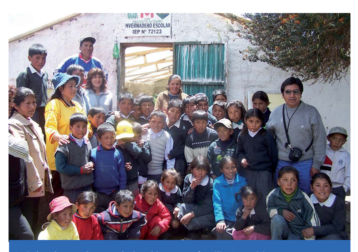
4- School greenhouses helped improve families' nutrition.