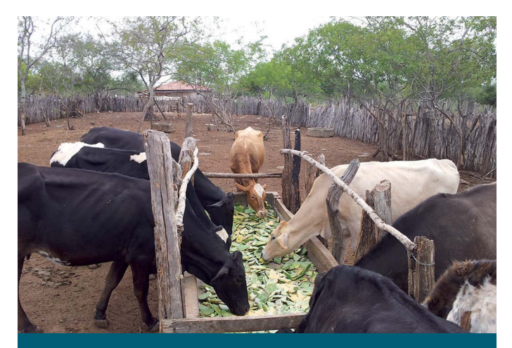
6- Cattle confined in corrals