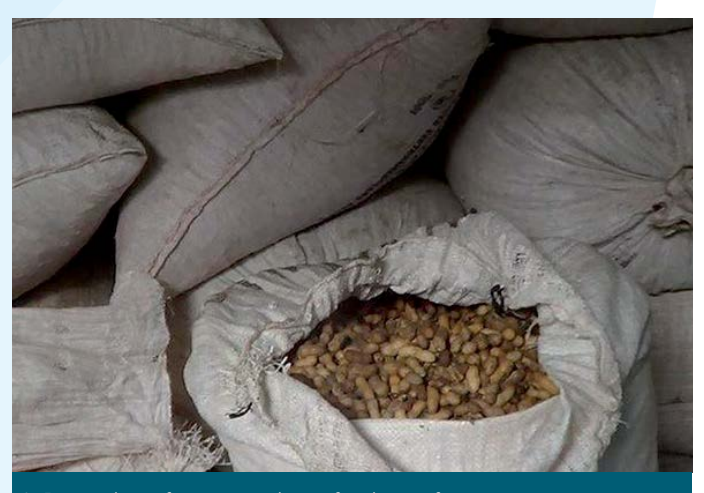
4- Peanut bags for group sales to food manufacturers.