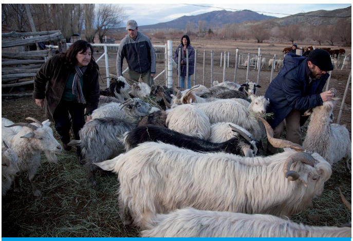
2- Producer and technicians from Río Negro inspecting goats before buying them in Neuquén.