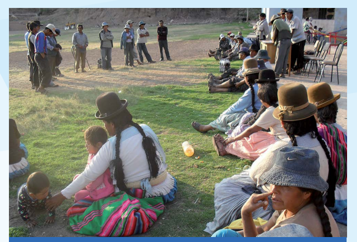
1- Farming families and technicians agree on the actions to be performed on their farms.