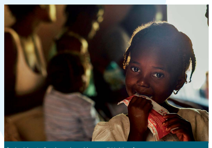
6- A girl eats food produced by small Haitian farmers.