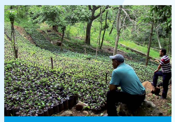
4- Farmers get certified-quality plants at a coffee nursery