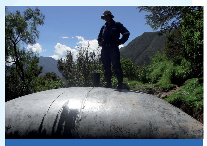
4- Irrigation President observes a reservoir full of water.