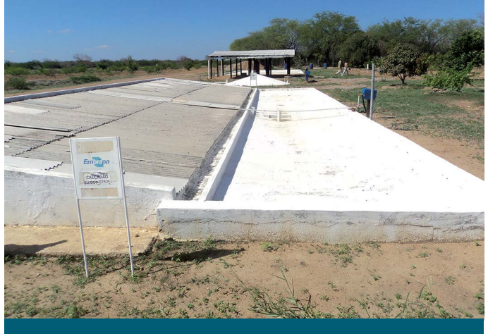
3- Storing water: cisterns, earth dams, etc.