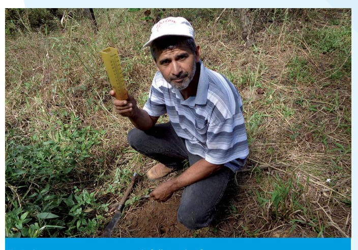
3- Rain gauge to measure rainfall on the farn