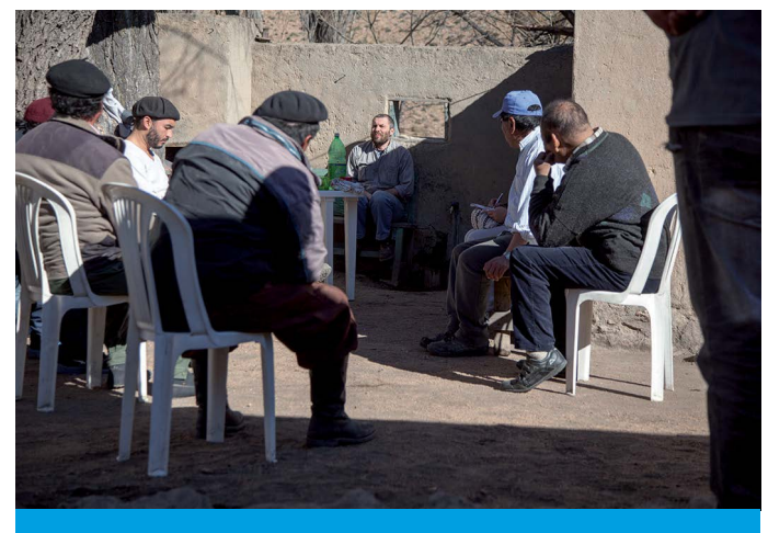
1- Technician and farmers agree on aspects of the project in Línea Sur.