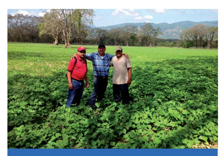
4- Some of the water uses of the Cáceres family

3- Cáceres Moncada family reservoir in Jalapa, Nicara