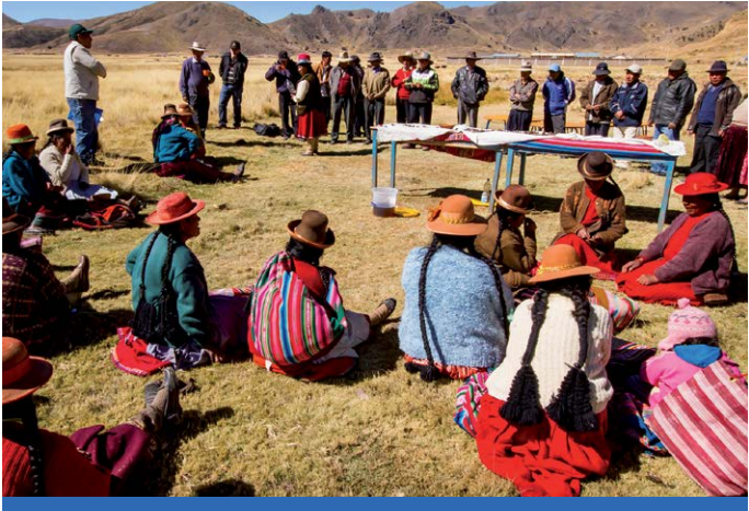
6- Training activity in the Peruvian Altiplano: key to knowledge dissemination.