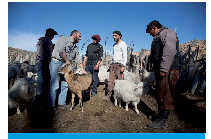
4- Goat receipt and inspection in Línea Sur field