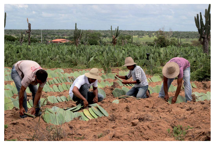
Farmers grow Nopal, which stores water and guarantees animal feed during the dry season in Brazil's Sertão.

Brazil's Sertão is Latin America's most populated semiarid region. Agricultural production is the main activity for 15% of its population and it is a source of additional income for many of its inhabitants. However, farmers achieve low yields due to their farms' low technological level and to the intensification of seasonal droughts over the past fifty years.