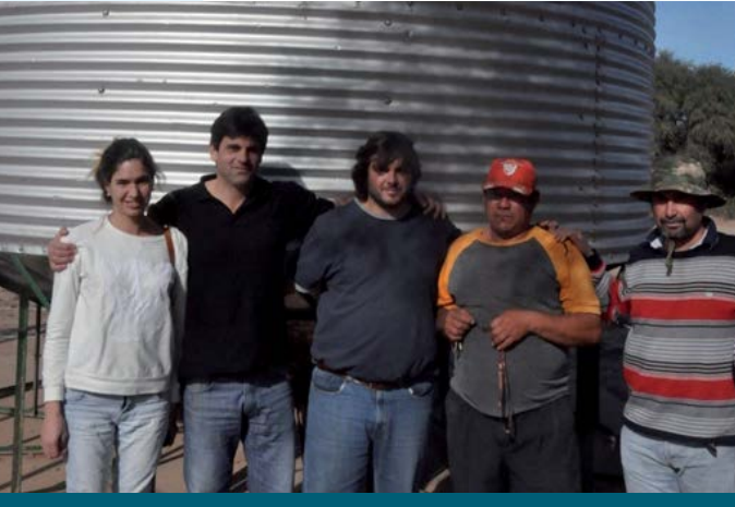
6- Farmers and technicians after a training session to improve the practice of supplementing their animals.