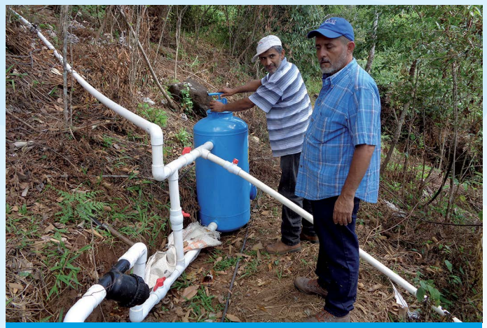
2- Farmers use micro irrigation equipment on sloping land to prevent runoff.