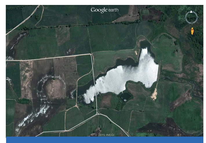
Satellite image of the Contreras family reservoir in Veracruz, Mexico.