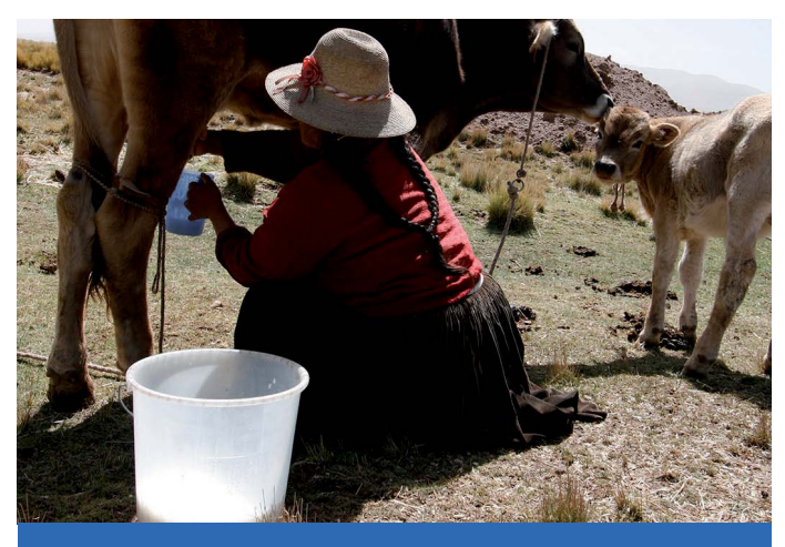
2- Farming women were largely responsible for milking.