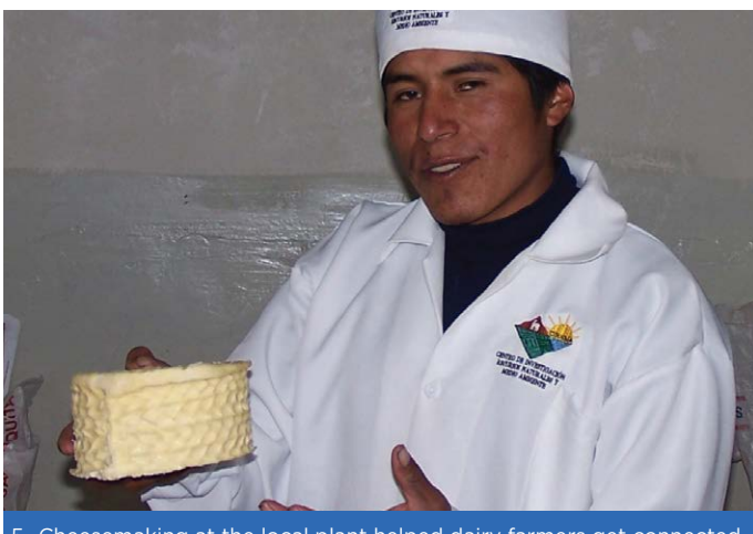
5- Cheesemaking at the local plant helped dairy farmers get connected to markets.