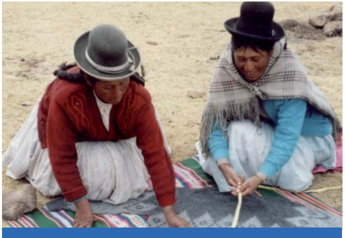
3- Quality control helped improve market access for crafts.