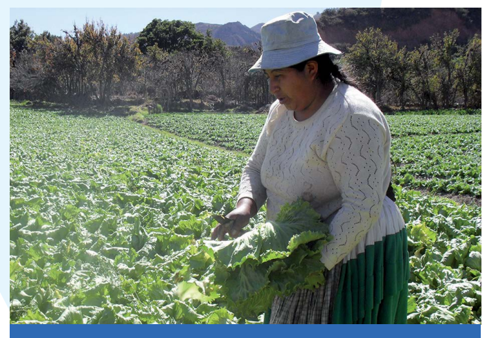
6- Farmer harvests lettuce to sell at the market in La Paz, Bolivia.