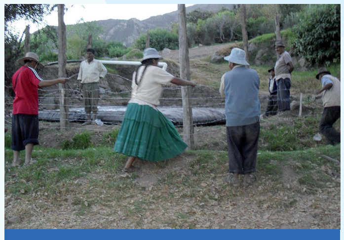
3- Farmers participate in group tasks to install a reservoir.

2- Farmer prepares the ground to irrigate with ancestral methods.