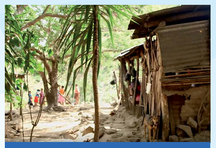
1- Houses of farmers in extreme poverty.