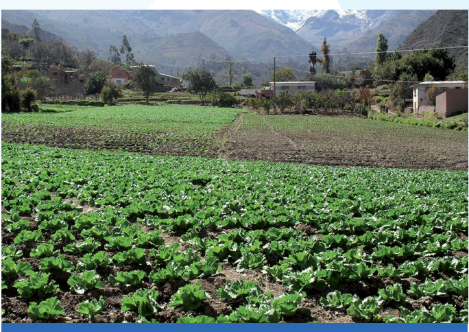
5- Vegetable crop in Cebollullo, at the foot of snow-covered Illimani mountain.