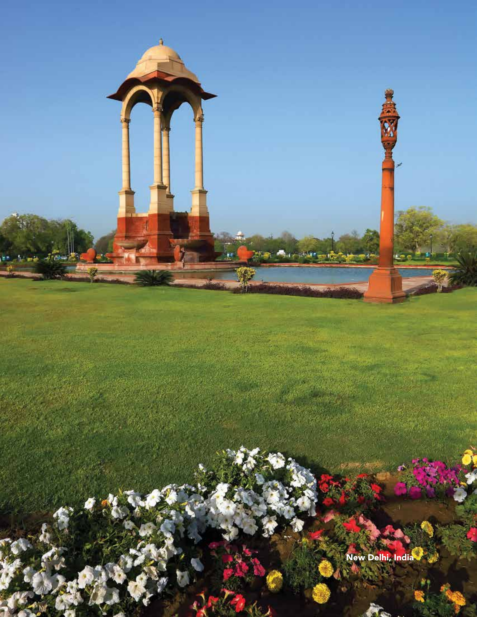
New Delhi, India