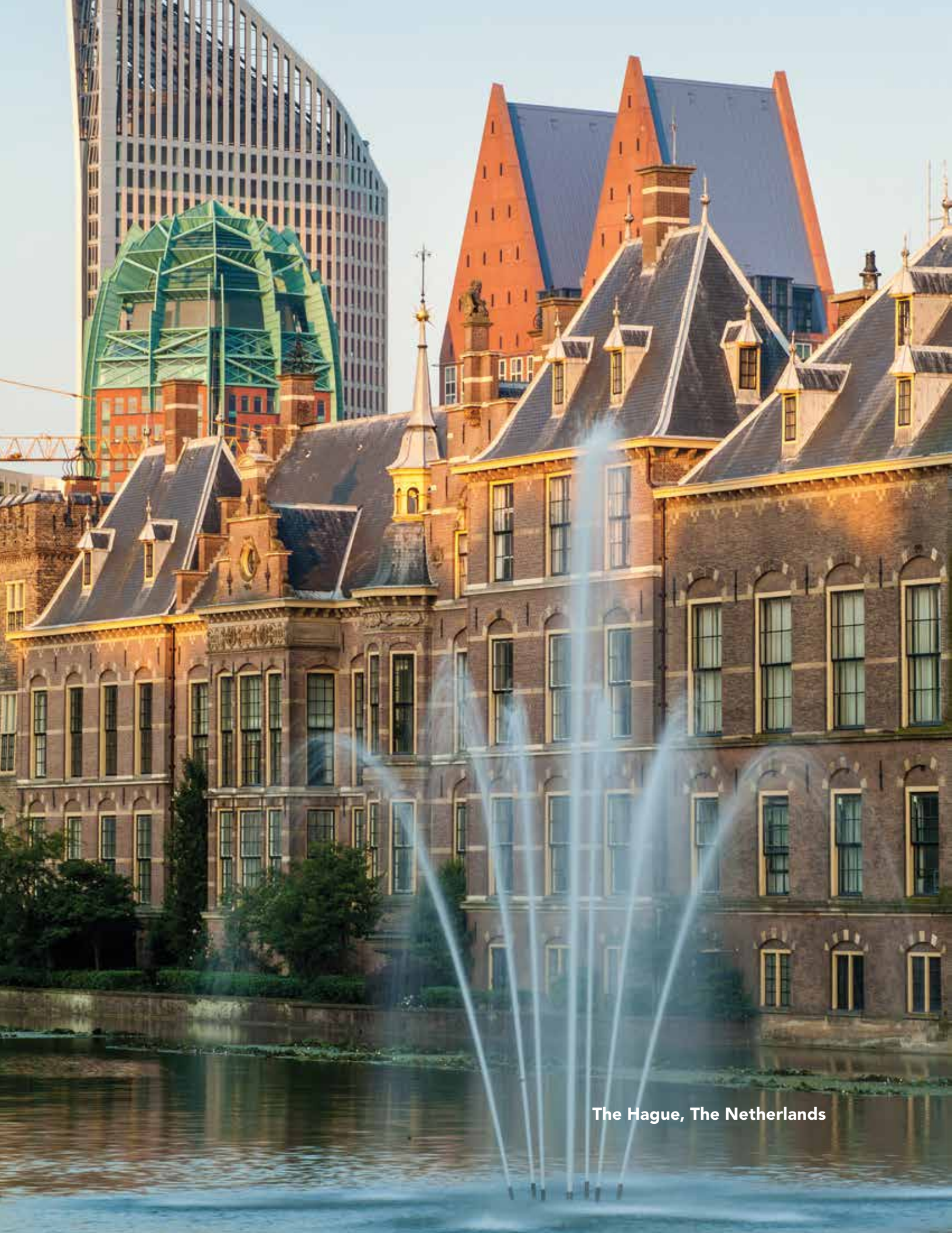
The Hague, The Netherlands