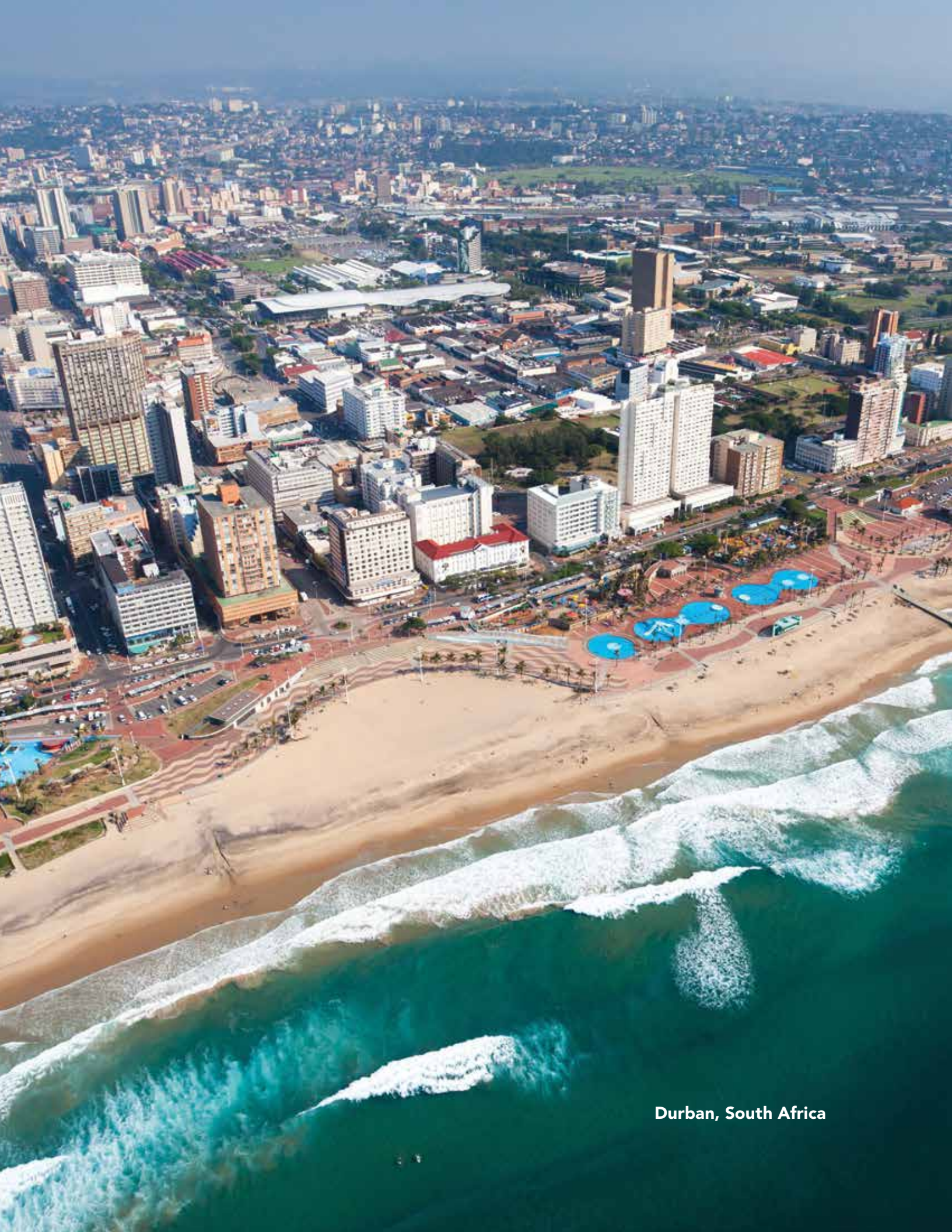
Durban, South Africa