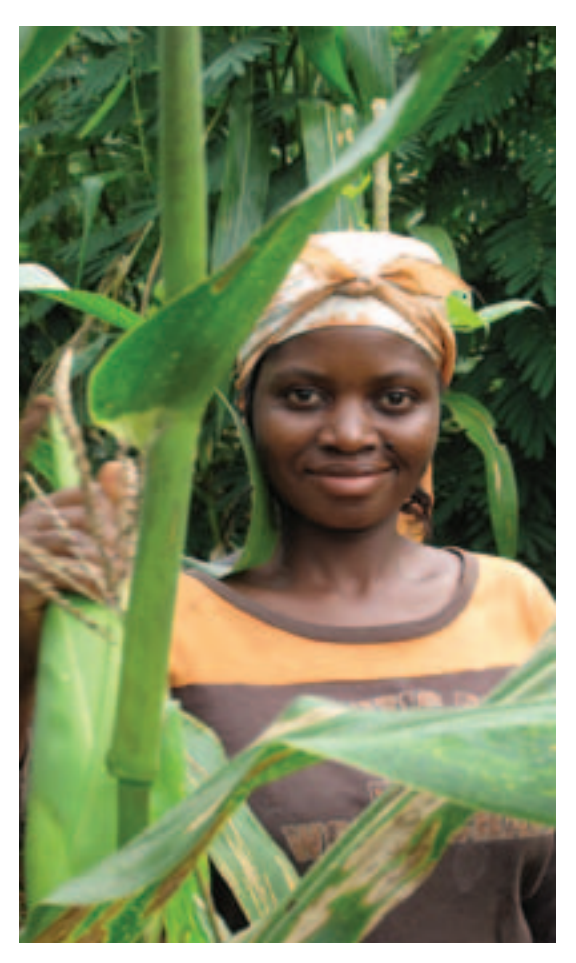
Farmers have experienced increases in maize yields after intercropping maize and fertilizer trees such as Calliandra.