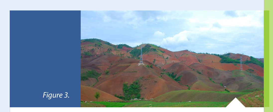
Expansion of agricultural area in Northwest Viet Nam.

Other drivers have different intensity or prevalence. For example, Thailand serves as a stark example of agriculture land expansion. The country lost