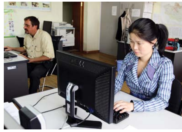
FAO is helping countries build capacity in the forest sector to respond to climate change, such as through FAO project GCP/MON/002/NET in Mongolia.

The following pages give more detail on the ways in which FAO is helping to build capacity to respond to climate change.