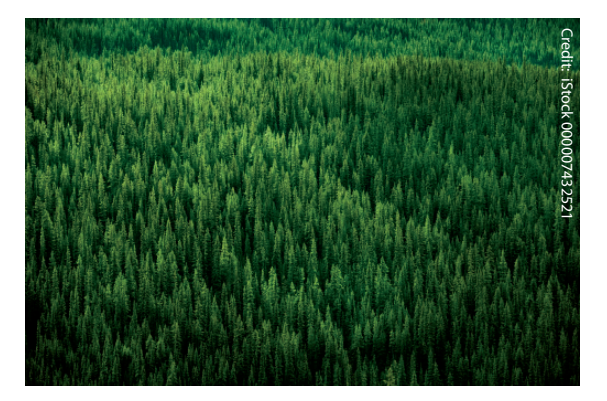
Evergreen trees on a mountainside in Banff National Park, Alberta, Canada

Diversity at the genetic level must also be complemented by diversity at the species level, particularly by species groups such as pollinators (e.g., insects, bats, birds) and seed-dispersal organisms (e.g., many birds and mammals) that may affect the long-term resilience of forest ecosystems. Without these associated species groups, tree species may be restricted