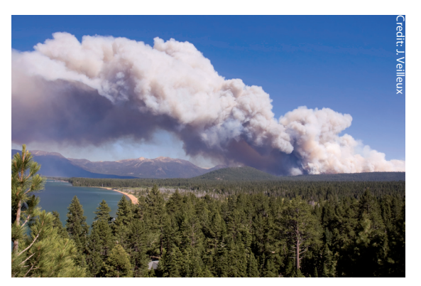
Cloud of smoke rising from the Angora forest fire in south Lake Tahoe, California

For a system to have resilience, the state of interest (e.g., the mature forest type) must be stable over a certain time period. Considerable research has explored the concept that species diversity enhances stability, defined as variation within defined bounds (time and space) or dynamic equilibrium, in ecosystem processes in response to environmental change (e.g., Loreau 2000, Hughes et al. 2002). The relationship between diversity and stability is complex and may resist generalization. Confusion over this issue stems from debate over whether stability refers to individual populations within ecosystems or the stability of ecosystems and their processes. For example, relatively recent work has suggested that as diversity increases, stability within individual population declines (e.g., Moffat 1996, Tilman and Lehman 2001).