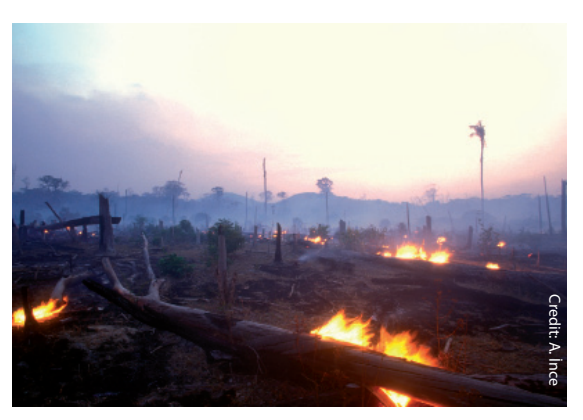
Forest fires in wet tropical forests can overcome the resilience of the ecosystem if they occur too frequently or over very large areas

Testing the theories of the relationship between diversity, productivity, and resilience in forests is difficult owing to the inability to control either extrinsic or intrinsic variables within these complex ecosystems. Furthermore, niche partitioning is wellknown in forests (e.g., Leigh et al. 2004, Pretzsch 2005), with many uncomplicated examples such as tap and diffuse rooting systems, shade tolerant and canopy species, and xeric and hydric species. Some confounding effects also affecting production in forests include successional stage, site differences, and history of management (Vila et al. 2005). Species mixtures change with successional stage in forests, from those rapidly-growing species favouring open canopy environments to those capable of reproducing and surviving in a more shaded canopy environment. Various plant species are adapted to site types that are defined by soils, topography, and moisture levels, but opportunistically may be found across a range of sites. Many forests, including most temperate forests, have undergone many direct anthropogenic-related changes and so an understanding of community structure must be in the context of the human history related to the stand.