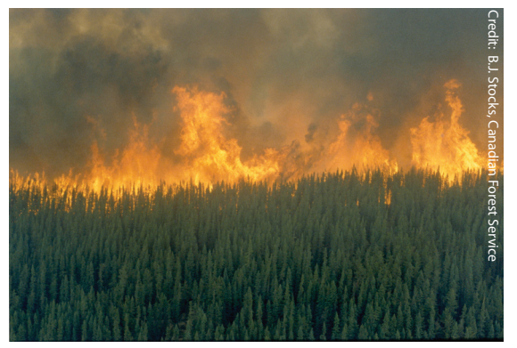
Many boreal conifer forests are prone to fire, however the species are well-adapted to this disturbance and the forest ecosystem rapidly regenerates. Hence, this kind of forest is not resistant to fire but it is highly resilient.