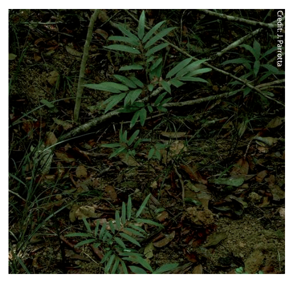
Following natural or anthropogenic disturbances creating forest gaps, regeneration from soil seed banks play a critical role in recovery of biodiversity in tropical forests. Location – Porto Trombetas, Pará State, Brazil.

Also in Costa Rica, tree species richness was correlated to increased production in afforestation experiments by Montagnini (2000), a result also reported by Erskine et al. (2006) for Australian tropical plantations of individual and mixed species. In one of the few published studies not to report a positive relationship between production and diversity, Finn et al. (2007) found that Australian tropical plantations that had been invaded by endemic species from nearby natural forests did not result in increased production, presumably because of inter-specific competition effects. Parrotta (1999) was able to show facilitation effects in mixed plantings of tree species in experimental tropical plantations, with mixed species plots producing