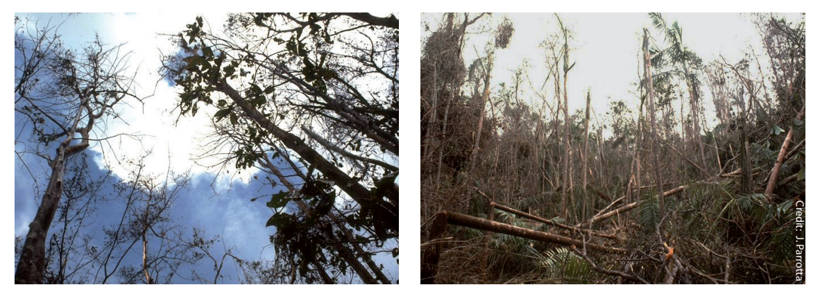
In many tropical regions such as the Caribbean, forests are adapted to periodic major disturbances by hurricanes. The resilience of these tropical forests enable their rapid recovery of structural and functional attributes. These photos of El Yunque National Forest, Puerto Rico, were taken two months after Hurricane Hugo in 1989.

The capacity for long-distance migration of plants by seed dispersal is particularly important in the event of rapid environmental change. Most, and probably all, species are capable of long-distance seed dispersal, despite morphological dispersal syndromes that would indicate morphological adaptations primarily for short-distance dispersal (Cwyner and MacDonald 1986, Higgins et al. 2003). Assessments of mean migration rates found no significant differences between wind and animal dispersed plants (Wilkinson 1997, Higgins et al. 2003). Long-distance migration can also be strongly influenced by habitat suitability (Higgins and Richardson 1999) suggesting that rapid migration may become more frequent and visible with rapid changes in habitat suitability under scenarios of rapid climate change. The discrepancy between estimated and observed migration rates during re-colonization of northern temperate forests following the retreat of glaciers can be accounted for by the underestimation of long-distance dispersal rates and events (Brunet and von Oheimb 1998, Clark 1998, Cain et al. 1998, 2000). Nevertheless, concerns persist that potential migration and adaptation rates of many tree species may not be able to keep pace with projected global warming (Davis 1989, Huntley 1991, Dyer 1995, Collingham et al. 1996, Malcolm et al. 2002). However, these models refer to fundamental niches and generally ignore the ecological interactions that also govern species distributions.