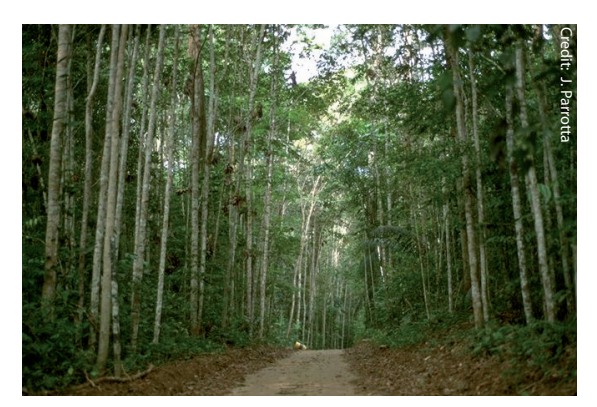
Natural regeneration of lowland Amazonian rainforest 18 years after clearcutting. Regrowth primarily from soil seed bank and resprouting of harvested trees. Porto Trombetas, Brazil.

in their ability to adapt to change through seed dispersal, pollination, and gene flow - important processes for maintaining genetic diversity and reproductive success within populations. For example, a certain amount of gene flow among populations is required to minimize the adverse effects of inbreeding and inbreeding depression on growth, reproduction, survival, and genetic diversity in small, isolated populations of species in highly fragmented landscapes. Small, isolated populations at the margins of the geographic range may also be of special importance to the resilience of forests under climatechange scenarios because such population islands often serve as well-adapted seed sources for population migration under environmental change (Cwynar and MacDonald 1987). It can be assumed that such populations at the geographic-range margins have experienced some physiological stresses while living at the limits of their eco-physiological tolerances. Such populations may have become adapted through natural selection and some degree of genetic isolation (Garcia-Ramos and Kirkpatrick 1997) and contain special adaptations that may enhance their value as special genetic resources for adaptation and resilience to change.