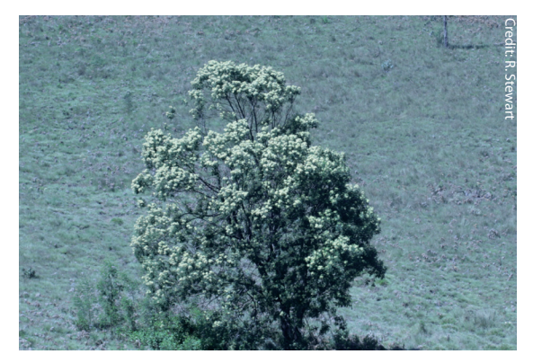
Black wattle has become an invasive species, altering riparian forest communities in many areas, such as South Africa

Generally, there have been equivocal results when the number of native plants in a system is compared to the number of introduced plant species in a system (e.g., Levine 2000, Macdonald et al. 1989, Keeley et al. 2003). The issue of invasion, however, is complicated by the level of disturbance in a given ecosystem, the extent of the undisturbed area owing to edge effects, and the scale of measurement, for example, and, as a result, deriving a general hypothesis for forests is confounded. Evidence clearly indicates that disturbed systems are more prone to invasion than undisturbed systems and that