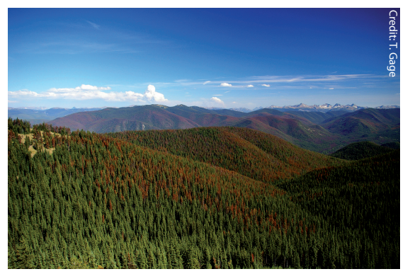
Lodgepole pine ( Pinus contorta )killed by the mountain pine beetle (in red) in British Columbia, Canada

Lodgepole pine forests are a self-replacing, firedriven ecosystems (Brown 1975) and climate change is generally predicted to reduce the fire interval over much of their distribution (Flannigan et al. 2005). However, ecosystem models suggest that stands may remain as carbon sinks even under increased fire regimes, in part because of the increase in production in response to temperature, but also depending on the model selected and the climate change regime that is modelled (Kashian et al. 2006, Smithwick et al. 2009). Insect infestation, notably mountain pine beetle (Dendroctonus ponderosae) can significantly alter the dynamic influence of fire, to the point of being the dominant factor responsible for stand renewal over huge landscapes (Logan and Powell 2001), and the combination of fires and insect infestation may lead to new forest states (Shore et al. 2006). If the insectkilled stands do not burn, then a large amount of carbon would enter the detrital pool. In lodgepole pine forests, the impact of climate change on carbon stocks may be marginal depending on infesta-