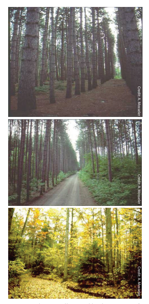
Forest resilience as illustrated by the recovery of mixedwood forest in eastern Canada as a result of red pine plantation on a logged site, with natural infilling by deciduous species over a period of about 50-80 years.

Resilience is an emergent property of ecosystems that is conferred at multiple scales by genes, species, functional groups of species (see definition below), and processes within the system (Gunderson 2000,