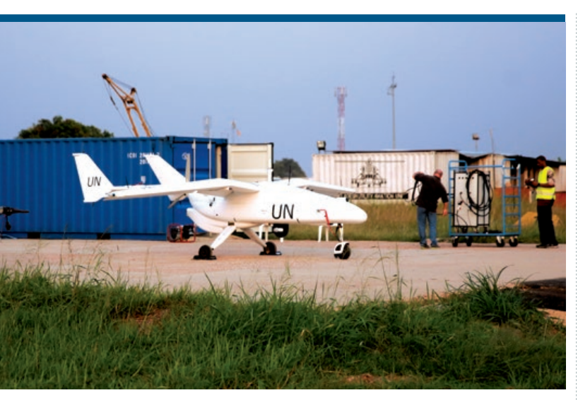
A UN unmanned aerial vehicle in the DRC. 🔟 UN Photo/Abel Kavanagh

perated either autonomously based on a preprogrammed flight plan or by remote control, unmanned aerial vehicles (UAVs), popularly known as drones, are now being deployed in Africa for a variety of missions.