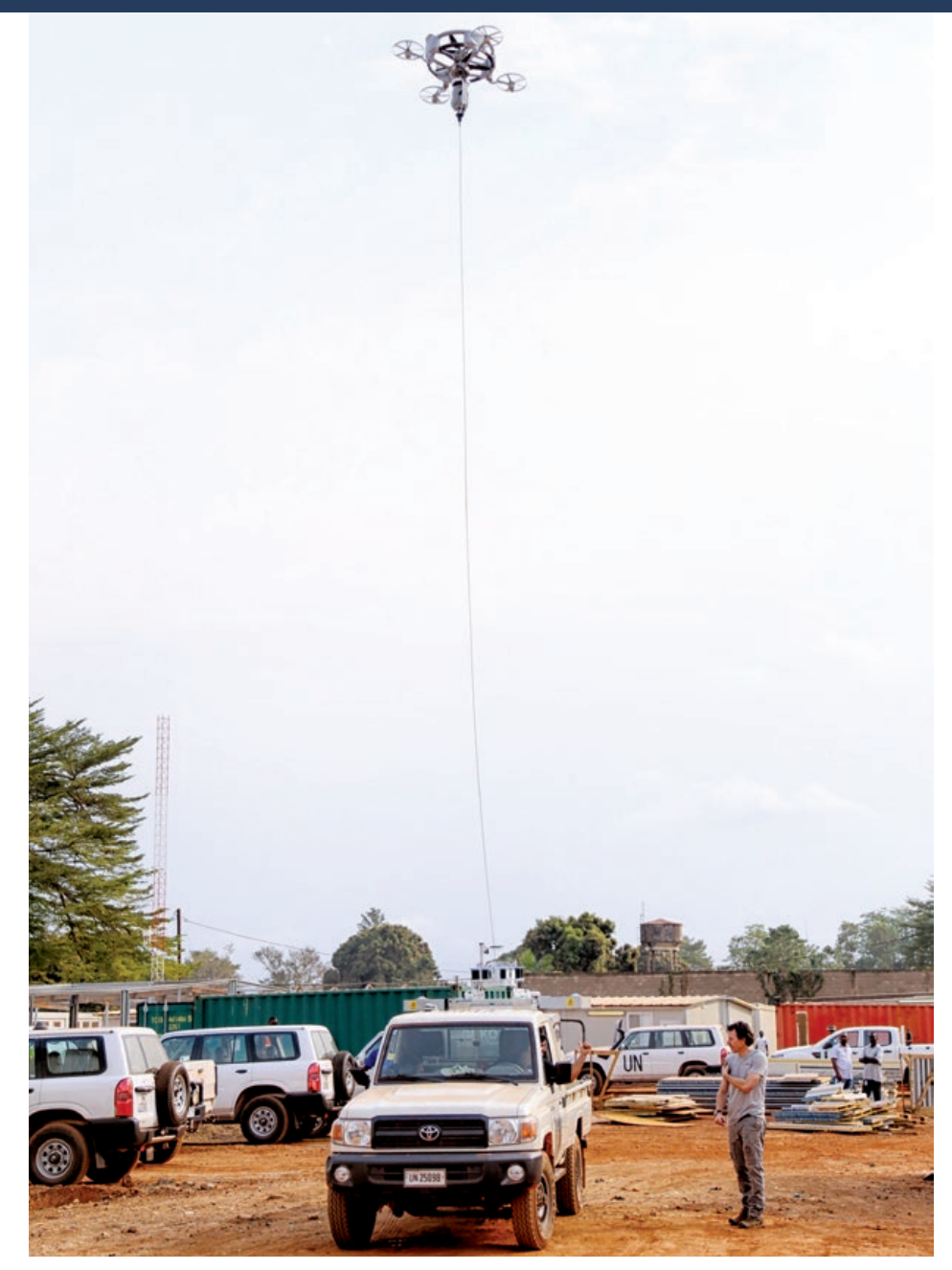
UN surveillance equipment under test attached to a truck.

That is certainly one way to go. It's not the only one, but I think it has to be recognized that we need the right, modern tools. UAVs, for example, can now be bought off the shelf even for recreational purposes, and even businesses are increasingly using them. Why should we deprive ourselves of readily available technologies?