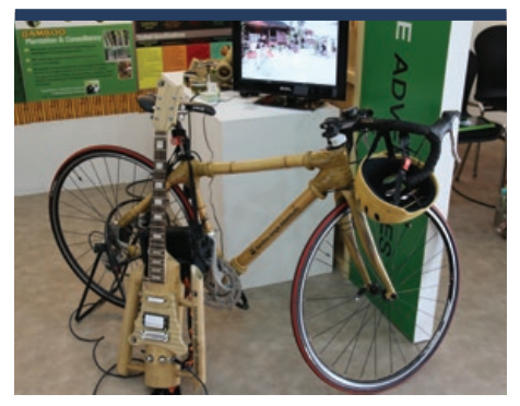
Bamboo products: Houses, furniture, lamp shades and a bicycle.

countries, like Angola, Gabon and Zambia, are expected to join the network.