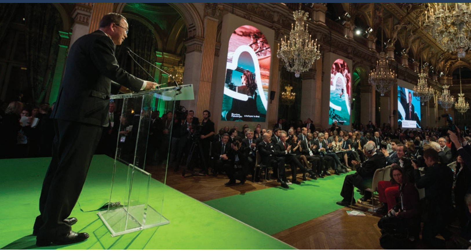
UN Secretary-General Ban Ki-moon addresses a summit of local leaders at the climate change conference in Paris. 🔯 UN Photo/Eskinder Debebe