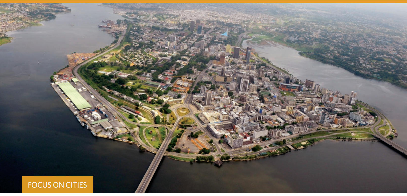
Aerial view of the district of Plateau in Abidjan, Côte d'Ivoire.

it by an elaborate display of orange lights, one of the three colours of Côte d'Ivoire's flag, the city of Abidjan ushered in 2016 with a spectacular fireworks display. For 25 minutes revellers in the commercial capital that calls itself the "perle des lumières" (pearl of lights) were treated to dazzling displays of colour in the sky above the Ebrié Lagoon.