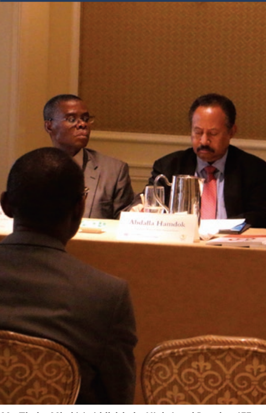
Mr. Thabo Mbeki (middle) led a High-Level Panel on IFF to

As billions are earned and extracted from the continent, more than 400 million Africans live on less than $1.25 a day (the threshold for absolute poverty), and the gross domestic product per person on the continent is just $2,000, which is a fifth of the global average, according to