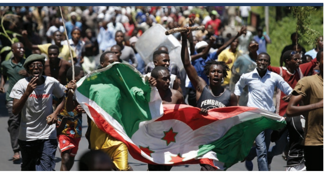
Demonstrators carry a Burundi flag during a protest in Bujumbura, Burundi.