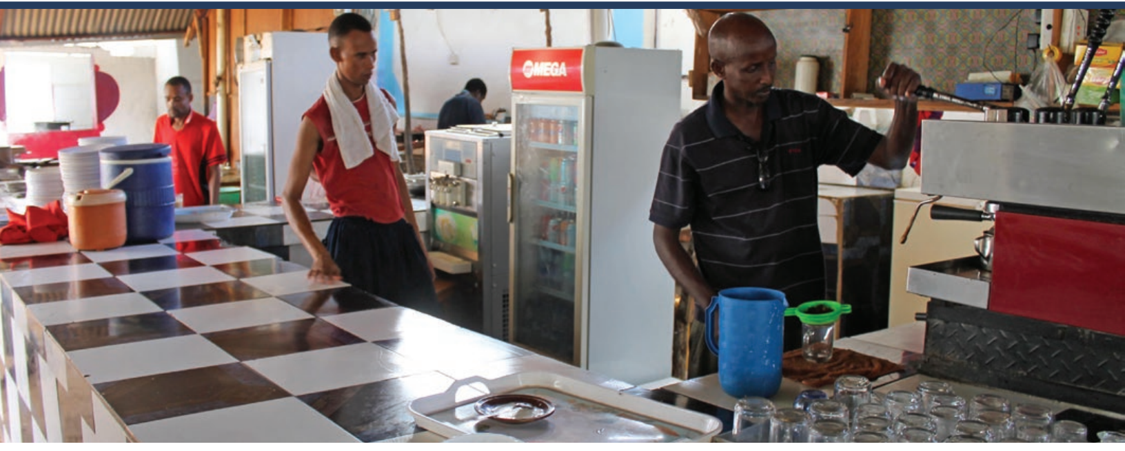
Somalis prepare coffee for customers in a Mogadishu restaurant.

hese days Somalis reminisce about life before the war. With a sense of nostalgia they reflect on the carefree days of swimming, picnics and cinema; when children were in school, the economy was growing and business was booming, providing jobs for thousands of Somali citizens.