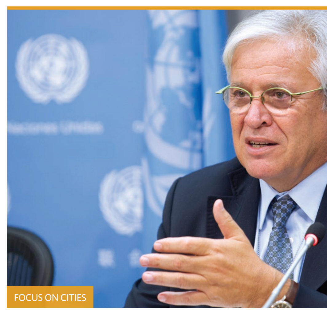
Dr. Joan Clos is the Executive Director of the Nairobi-based United Nations Human Settlements Programme (UN-

Megacities tend not to be sustainable but they are good evolutions for economic prosperity if they are well planned. In fact, there are many big cities around the world that are much bigger than the megacities of Africa. Tokyo, for example, has more than 35 million people, compared to some of Africa's megacities that have around 10 to 12 million people. The question is