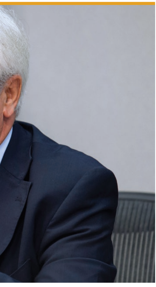
Habitat). 🗂 UN Photo/Rick Bajornas

Slums are a natural consequence of spon-