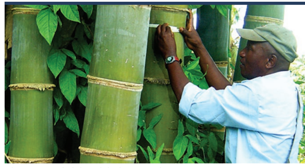
A farmer measuring the thickness of a bamboo tree in Madagascar.

"The biggest challenge is a lack of awareness," Tesfaye Hunde, the head of the East Africa Regional Office of INBAR in Addis Ababa, told Africa Renewal, adding that lack of finances and the absence of a national policy and strategy programme to develop and use bamboo resources were also hampering progress.