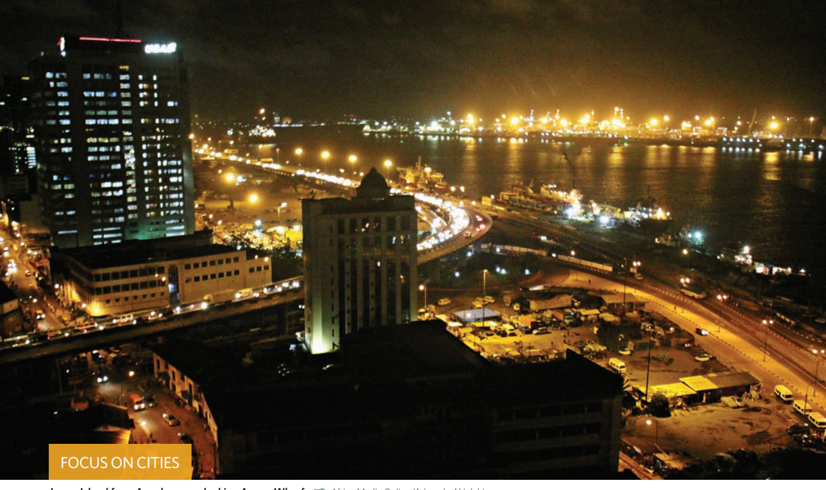
Lagos Island from Apogbon, overlooking Apapa Wharf.