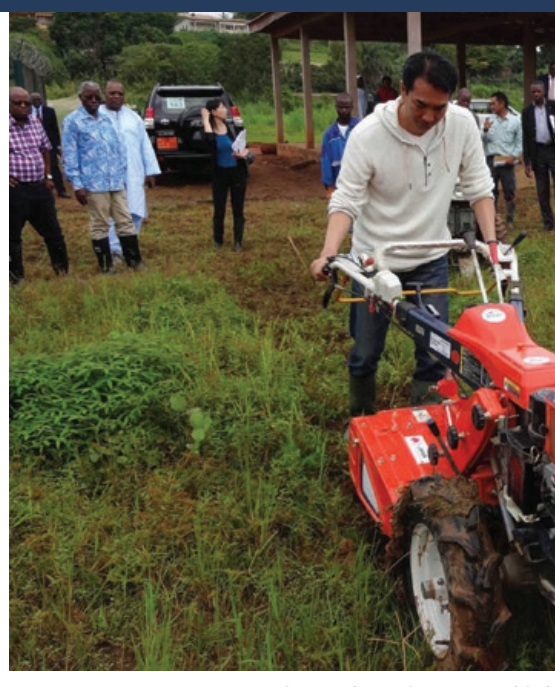
Japan's senior vice-minister of agriculture, forestry and fish Cameroon. The Government of Japan

Africa's untapped resources and its resilient economy are a powerful magnet for investors. The continent's GDP growth averaged 5% in the past decade, according to the World Bank, while its economy was resilient against the global financial crisis of 2007-2008. This prompted Prime Minister Abe to express the view that Africa is "no