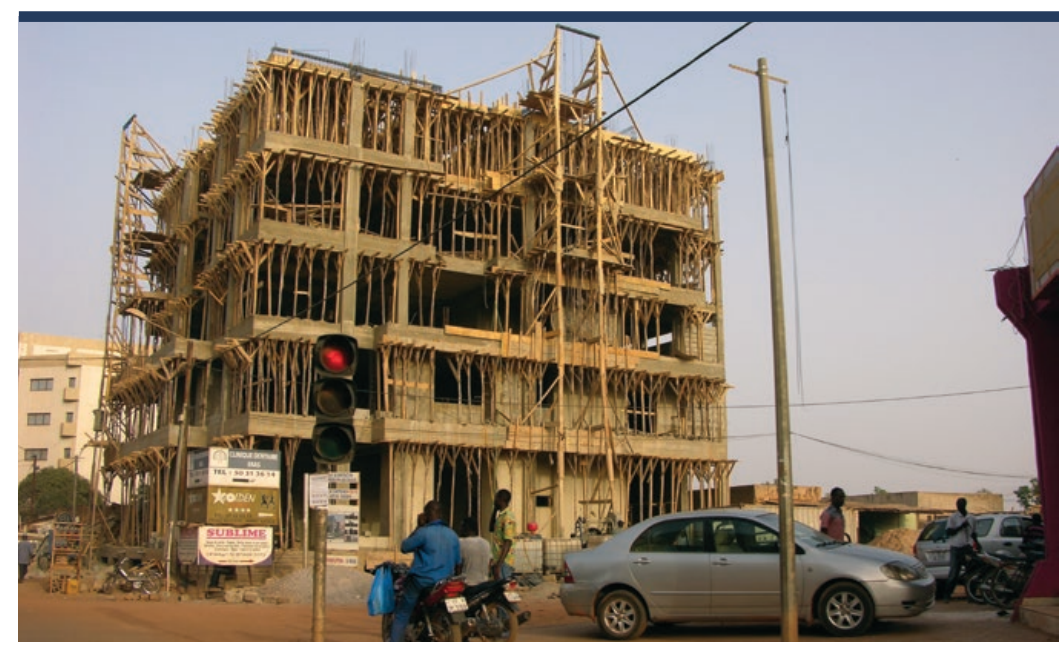
A building under construction in Ouagadougou.

But then came an unexpected attack on 15 January this year by fighters loyal to Al-Qaeda in the Islamic Maghreb, who had infiltrated the capital from across Burkina Faso's northern borders. More than 30 people, foreigners and Burkinabè, were slaughtered in the heart of the city. It was by far the worst terrorist assault the country had experienced. Once the initial shock lifted, a somber mood remained. Popular hopes did not vanish, but there was a sober realization that the road ahead would not, after all, be straight.