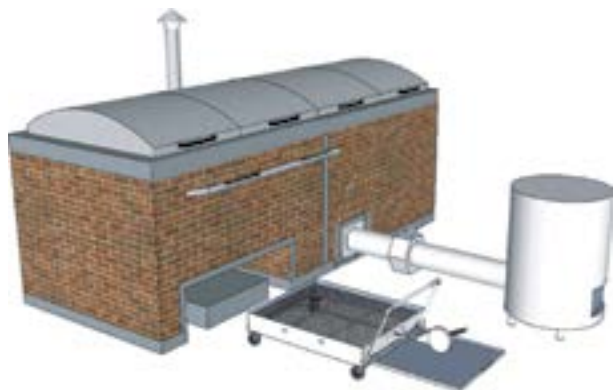
Figure 18.3 An Improved Smoking Kiln: The Thiaroye Fish Smoking Technology

time, given that fish processors are predominantly women. According to the latest statistics, in most fishing communities as many as 90 percent of workers in processing activities can be female (FAO 2014). Women, therefore, bear the brunt of the drudgery and health problems related to drying and smoking fish.