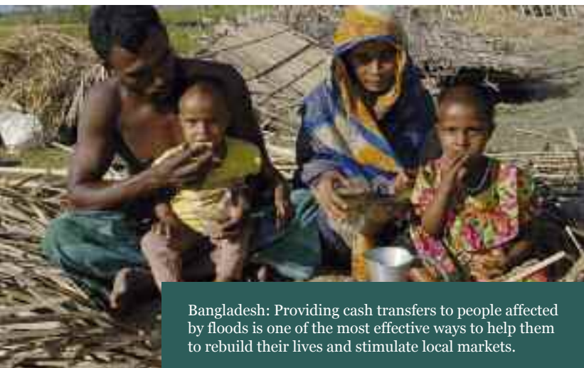
Bangladesh: Providing cash transfers to people affected by floods is one of the most effective ways to help them to rebuild their lives and stimulate local markets.

Collaboration between ITHACA and WFP includes flood forecasting, using satellites to map the impact of floods, cyclones and hurricanes globally, and providing response teams with meteorological data.