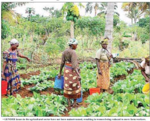
* GENDER issues in the agricultural sector have not been mainstreamed, resulting in women being reduced to mere farm workers.